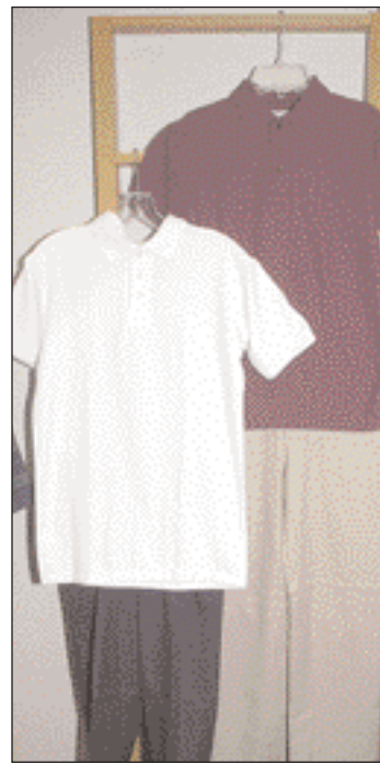
These types of items for the proposed District 201 dress code policy can be found at Rising Stars on West Main Street in Belleville.

The best way to guess who might be appointed as the new bishop could be to take a historical look. The Catholic Church traditionally elevates someone between ages 55 and 65 already serving in a leadership position, said the Rev.