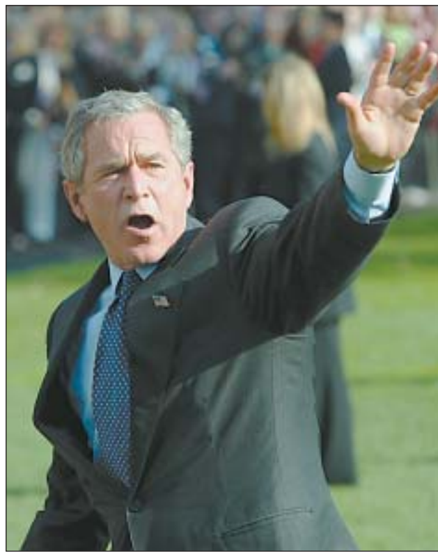
President Bush waves confidently as he walks across the South Lawn at the White House