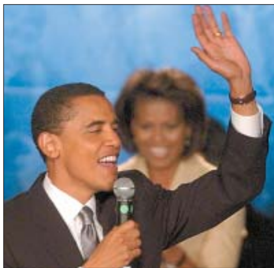
Senator-elect Barack Obama waves during his acceptance speech in Chicago