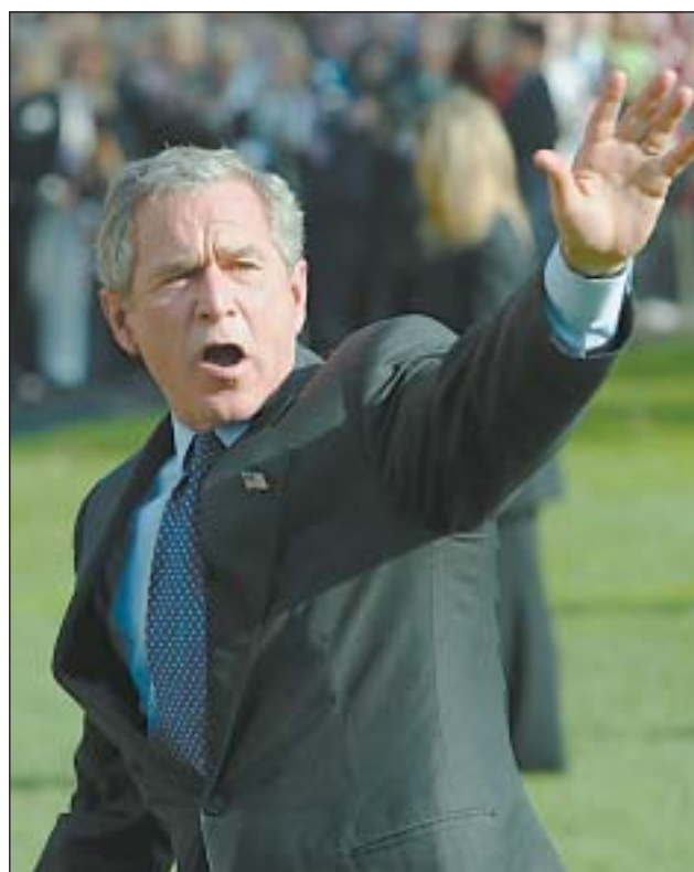
President Bush waves confidently as he walks across the South Lawn at the White House