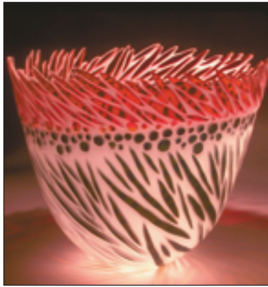
RENEE AND JIM ENGBRETSON/Glass