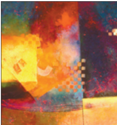
BETTY NEUBAUER/Oil and acrylic