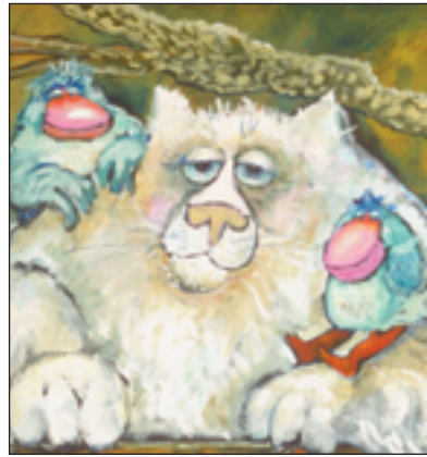
DON NEDOBEK/Oil and acrylic